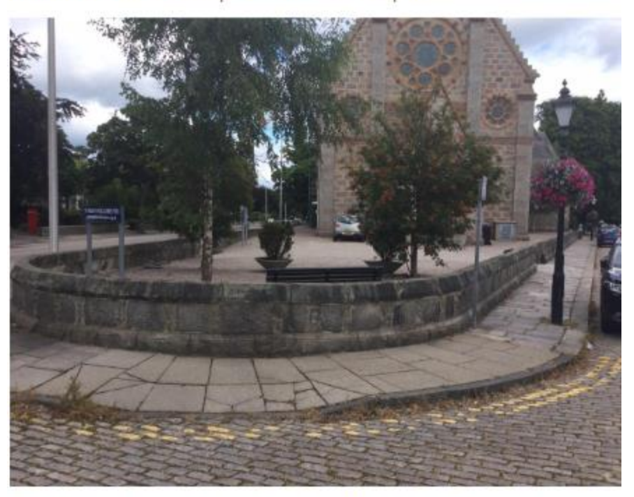
Shows car access from Carden Place. Garden to fill area at point beyond access.

Front area down to car access points to be hard landscaped.